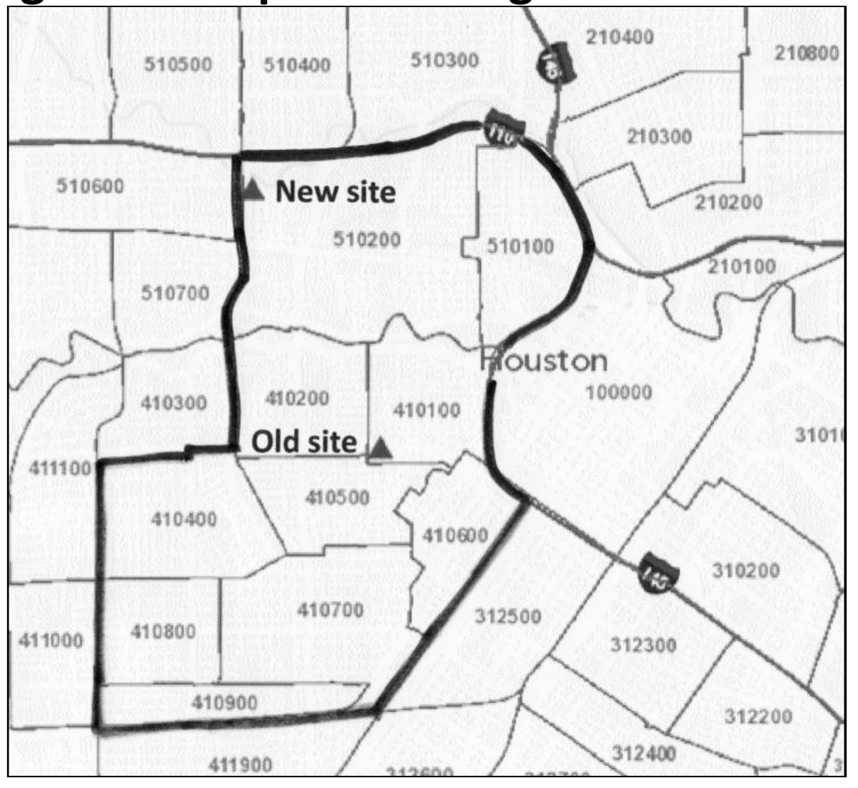
Figure 1: Map of the Original Service Area

Original service area boundary (tracts 4101, 4102, 4104, 4105, 4106, 4107, 4108, 4109, 5101, 5102)